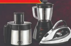
Useful Household Appliances