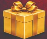
And many more attractive prizes