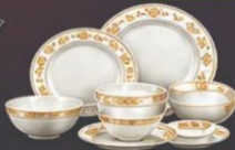
La Opala Dinner Set